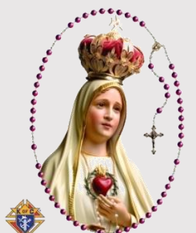
MARY QUEEN OF THE KNIGHTS PRAY FOR US